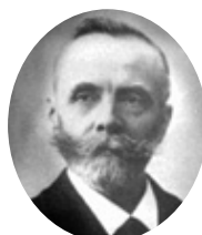
Heinrich Quincke (1842-1922:GER)

K-3 LANCET POINT can be described as modification of LANCET POINT, and is mainly used for Spinal Anesthesia. The original model was designed by Dr. H. Quincke in Germany, so is called as QUINCKE POINT as well. It is characterized by appropriate penetration resistance and ease of handling in puncture.